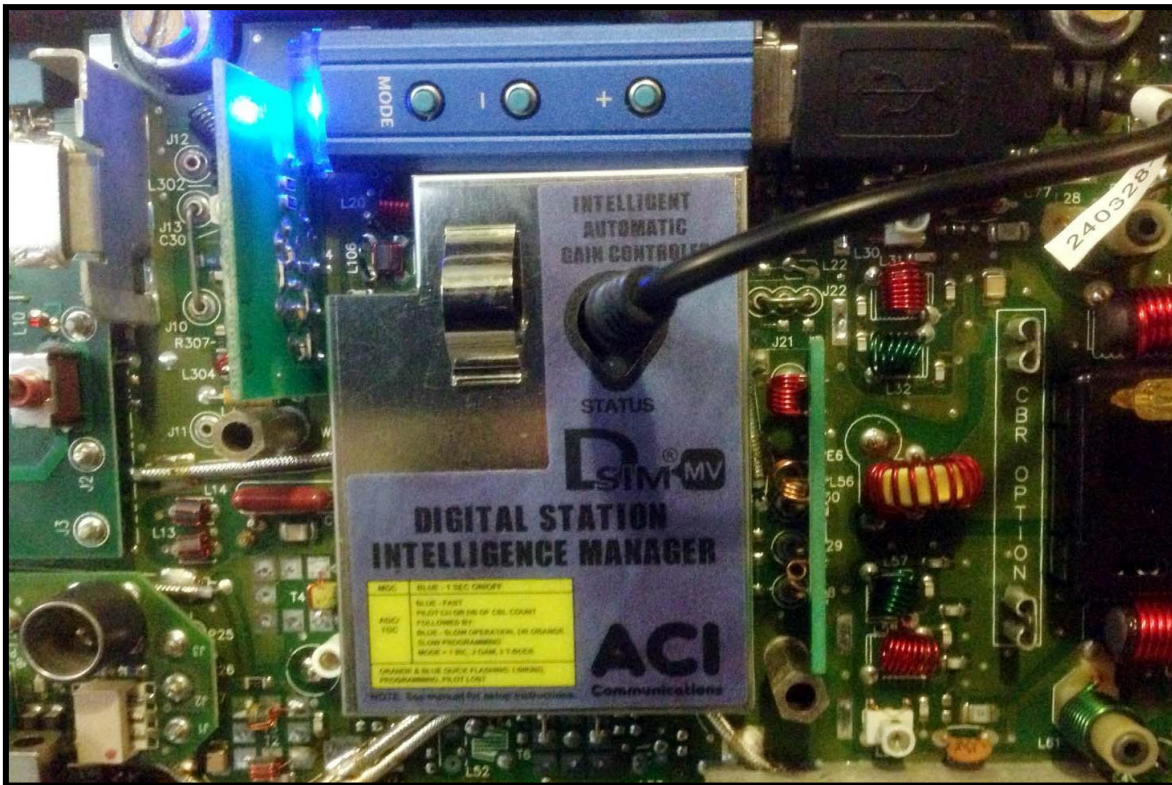
Controller Connection to DSIM (Shown with faceplate cover removed for clarity)