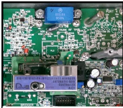
DSIM-CF (FNT/FNB 700)