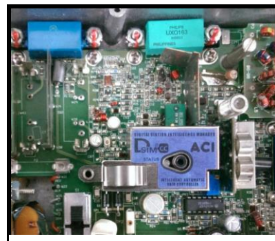
DSIM-CC (Flexnet E7 series)

DSIM-CF and DSIM-CC Installed in the RF modules (Shown with faceplate cover removed for clarity)