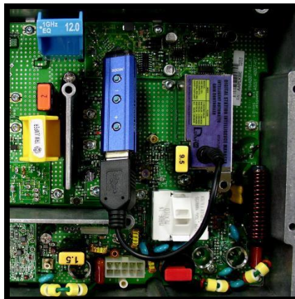
Controller Connection to DSIM (Shown with faceplate cover removed for clarity)