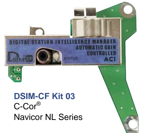
DSIM-CF Kit 03 C-Cor® Navicor NL Series