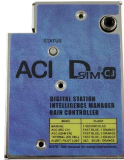
DSIM-CJ Arris® FM601e-T/B