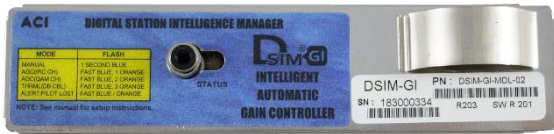
DSIM-GI Motorola®, BLE, MB, BT Post 750-DH 6-pin