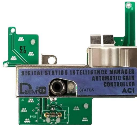
DSIM-CF Kit 05 C-Cor® Flexnet FNT 900 PN: FNT95DJT-KB6P6A1