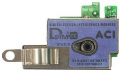
DSIM-CC Kit 01 C-Cor® Flexnet E7 series LE