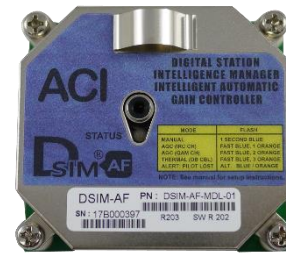
DSIM-AF Antec® FTMB-75 Series