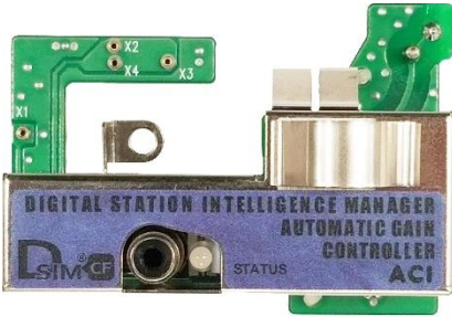
DSIM-CF Kit 01 C-Cor® Flexnet FNT & FNB 700/800