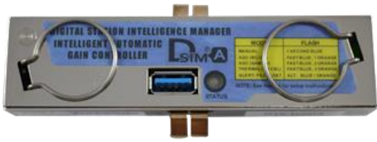
DSIM-A Augat® ACI SDA and ALX