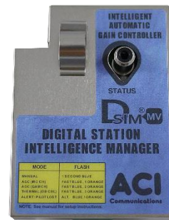
DSIM-MV Philips®/Magnavox® Diamond Type 1, 2, 3