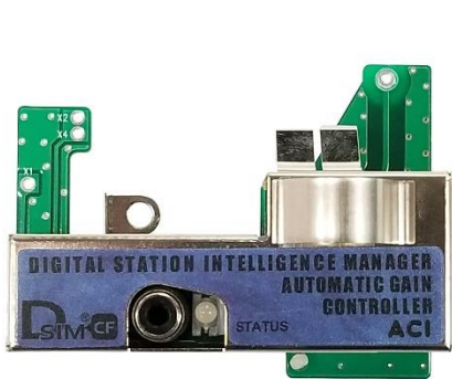
DSIM-CF Kit 04 C-Cor® Flexnet FNB 900 PN: FNB9ADJT-KB6N6A1 PN: FNB96CL-KB6G6A1