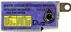
DSIM-SG Cisco®/Scientific Atlanta® GainMaker