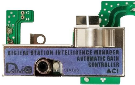
DSIM-CF Kit 02 C-Cor® Flexnet FNT & FNB 900 PN: FNB9ADJ-LD6GA1 PN: FNT95DJ-KB6K1A1