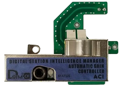
DSIM-CF Kit 06 C-Cor® Flex Max® 901e T/B