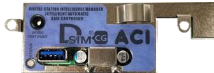
DSIM-CG C-Cor® 6-LE97/98 LE/ Spectrum 2000