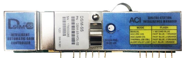
DSIM-SS 02 (W/ EQ) Cisco®/Scientific Atlanta® System Amplifier II & III