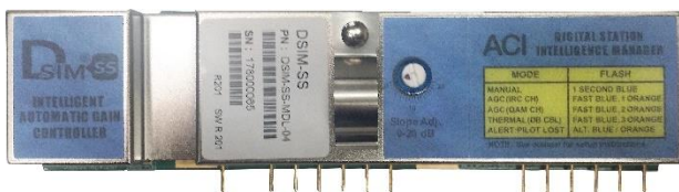
DSIM-SS 04 (W/O EQ) Cisco®/Scientific Atlanta® System Amplifier III LE 12VDC PWS