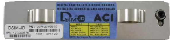
DSIM-JD Jerrold® JLX Line Extender 750-D/H 5-pin