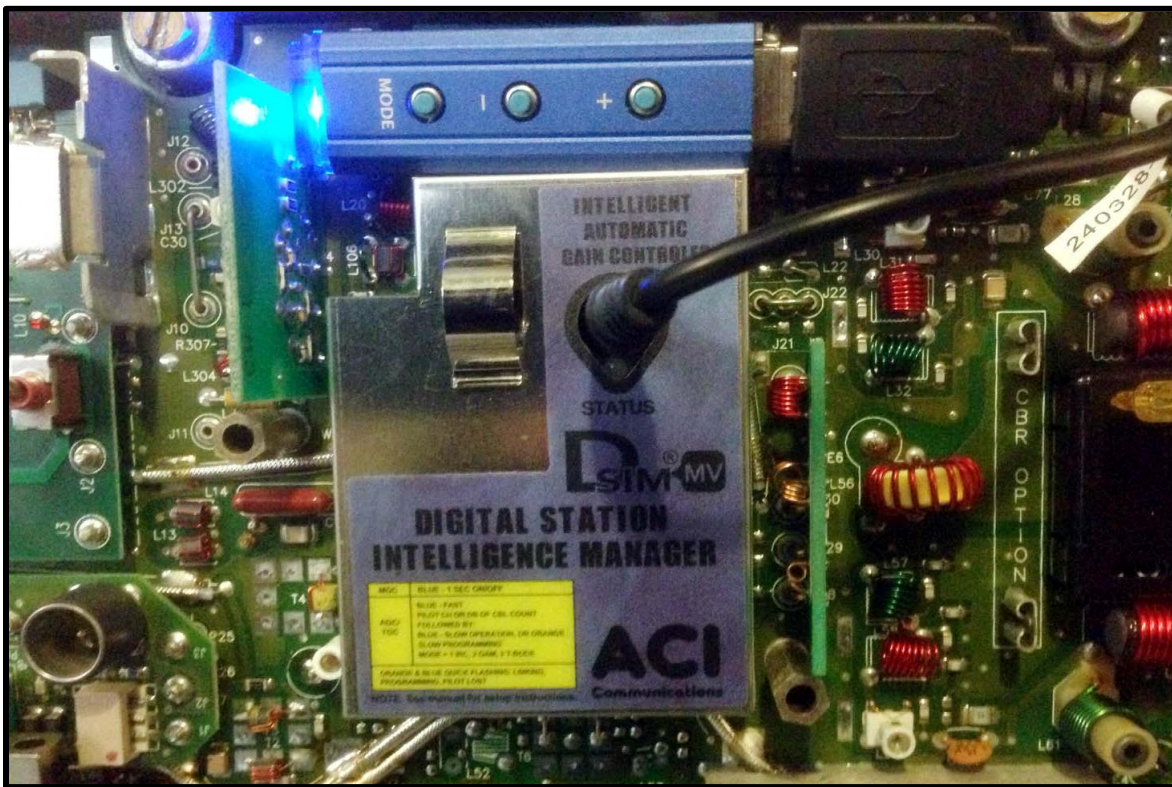
Controller Connection to DSIM (Shown with faceplate cover removed for clarity)