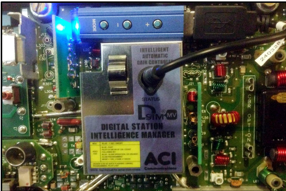
Controller Connection to DSIM (Shown with faceplate cover removed for clarity)